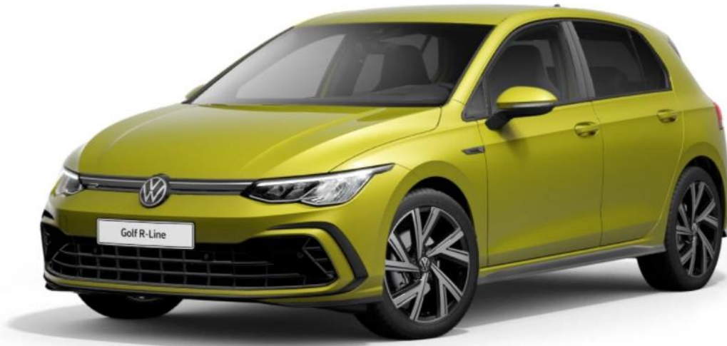
TSI R-Line shown